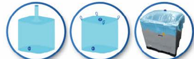
trunks tie tapes cuffs and tapes