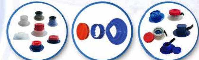
filling: 1", 2", 3", 6" discharging: 2" and 3" cutter-membrane system discharging: valves: 2", 3"