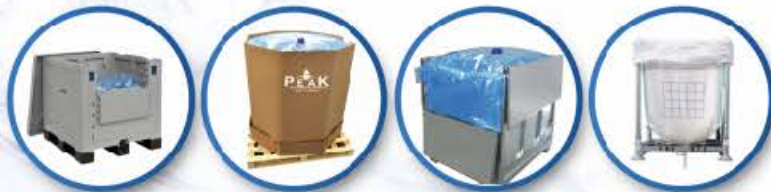
plastic containers octabins metal containers Big Bag Containers (BBC)