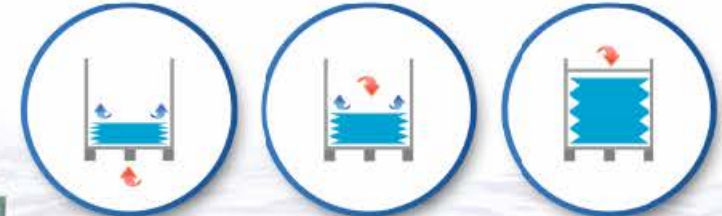
filling through the bottom valve filling through the top valve filling with unfolded liner ideal alternative for Shetz/Mausler